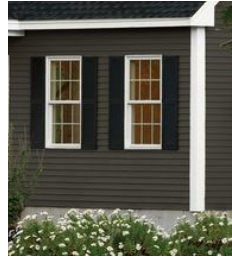
New siding color is IRON!