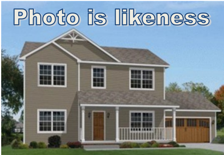
Photo is likeness

Quaker Highlands Subdivision Clark Road at the intersection of Brand Hollow Rd.